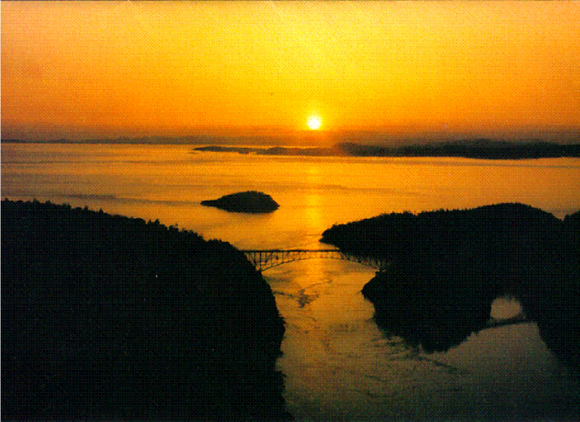
Photo of Deception Pass, Whidbey Island, Washington

If I take the wings of the morning, and dwell in the uttermost parts of the sea; even there thy hand shall lead me, and thy right hand shall hold me. (Psalm 139:9, 10)